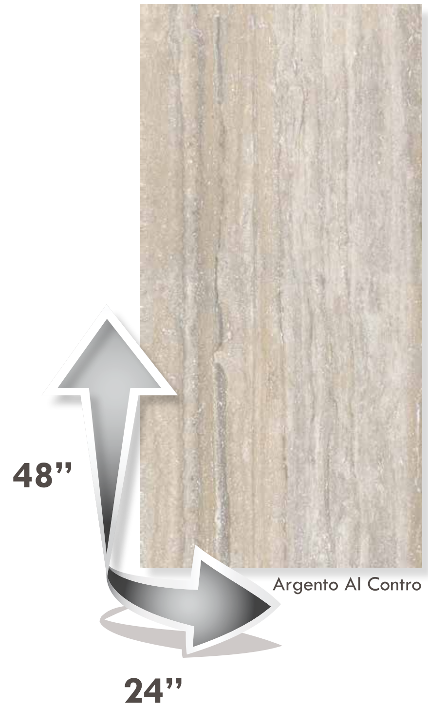
Argento Al Contro