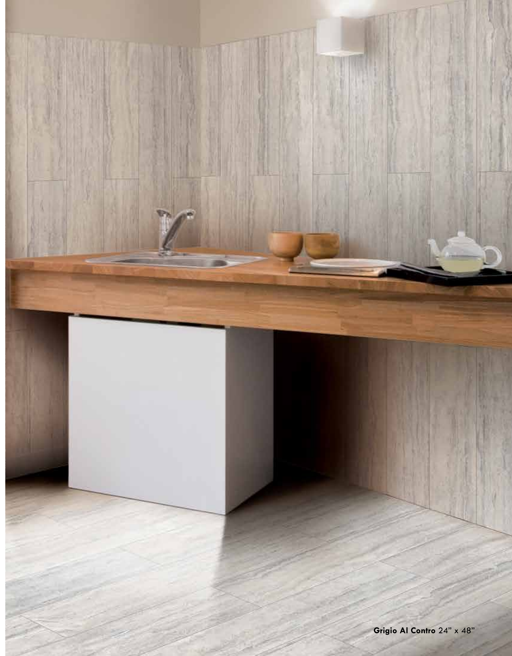
Grigio Al Contro 24" x 48"