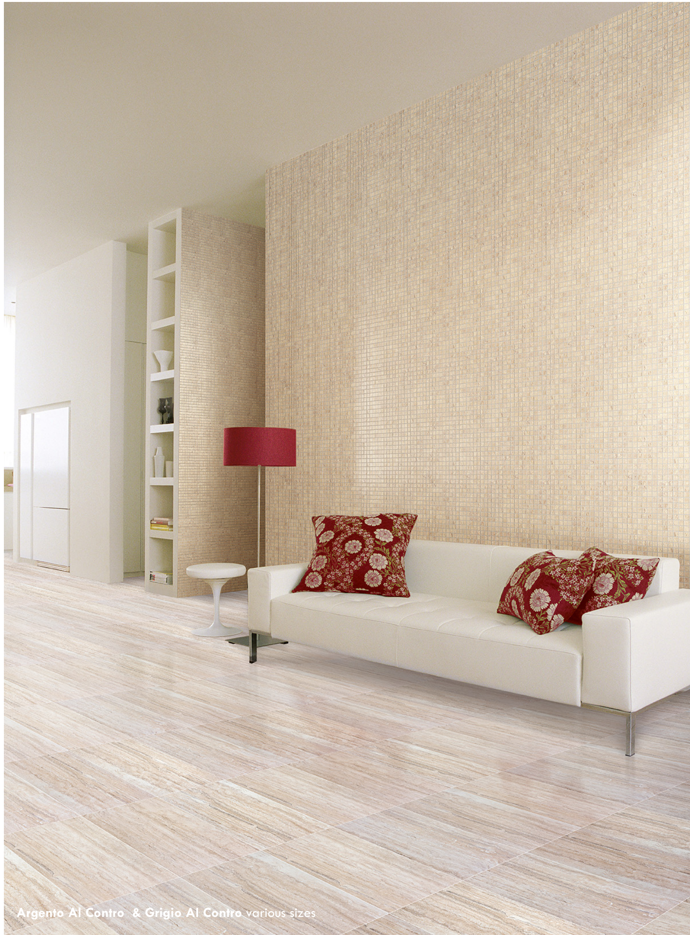
Argento Al Contro & Grigio Al Contro various sizes

C1028 COF Dry ≥ 0.75 Wet ≥ 0.60 Acutest DCOF Wet ≥ 0.42