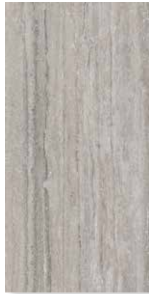
Grigio Al Contro