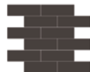
Brick 03 Mosaic