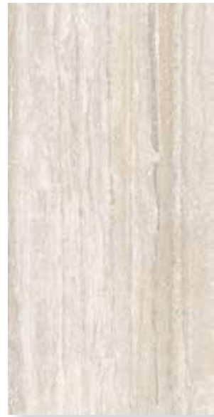
Bianco Al Contro