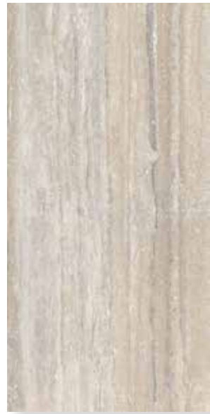
Argento Al Contro