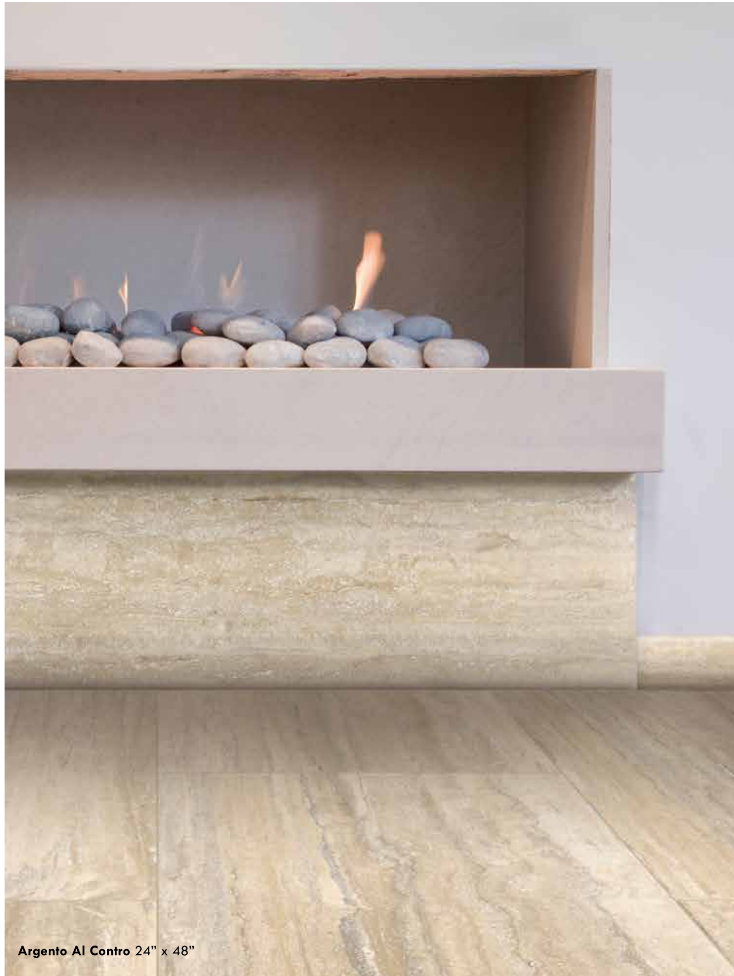
Argento Al Contro 24" x 48"