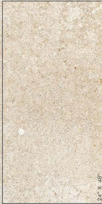
24" X 48"

Available in Honed and Textured R11 finish