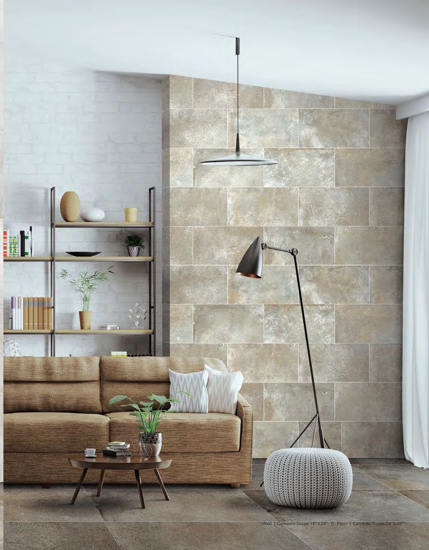
Wall | Cemento Toupe 12"X24" || Floor | Cemento Toupe 24"X48"