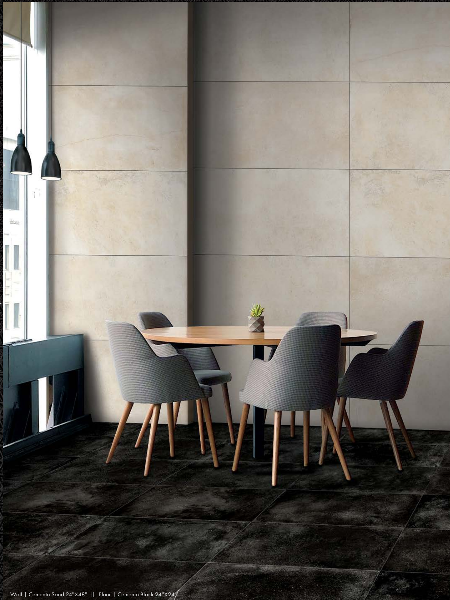
Wall | Cemento Sand 24"X48" || Floor | Cemento Black 24"X24"