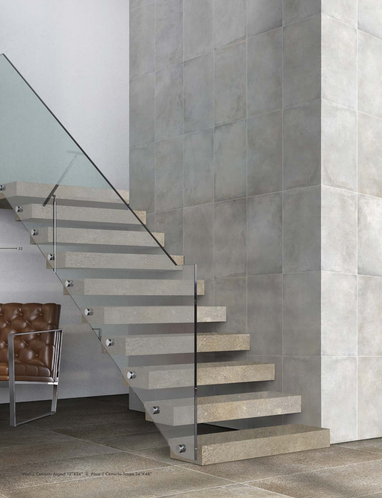
Wall | Cemento Argent 12"X24" || Floor | Cemento Toupe 24"X48"