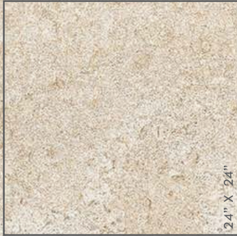
24" X 24"