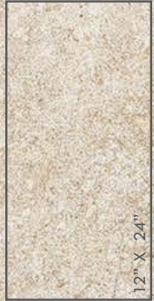
12" X 24"