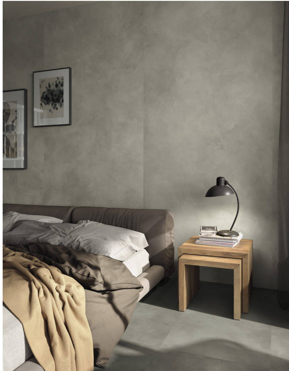
Wall: Awake CL 03 SP SQ 1200x2780 / 48"x110" Floor: Awake CL 03 SP SQ 600x1200 / 24"x48"