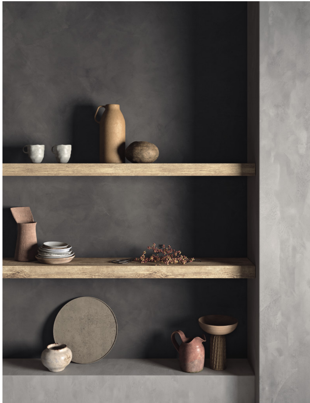
Wall: Verve CL 05 SP SQ 1200x2780 / 48"x110" Bench: Verve CL 05 SP SQ Floor: Delight CL 02 SP SQ 1200x1200 / 48"x48"