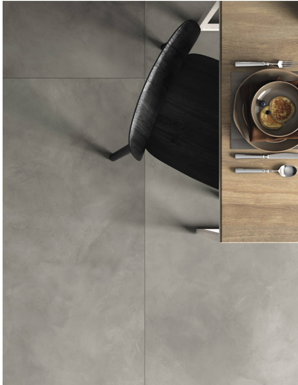
Wall: Awake CL 03 SP SQ 1200x2780 / 48"x110" Floor: Awake CL 03 SP SQ 1200x1200 / 48"x48"