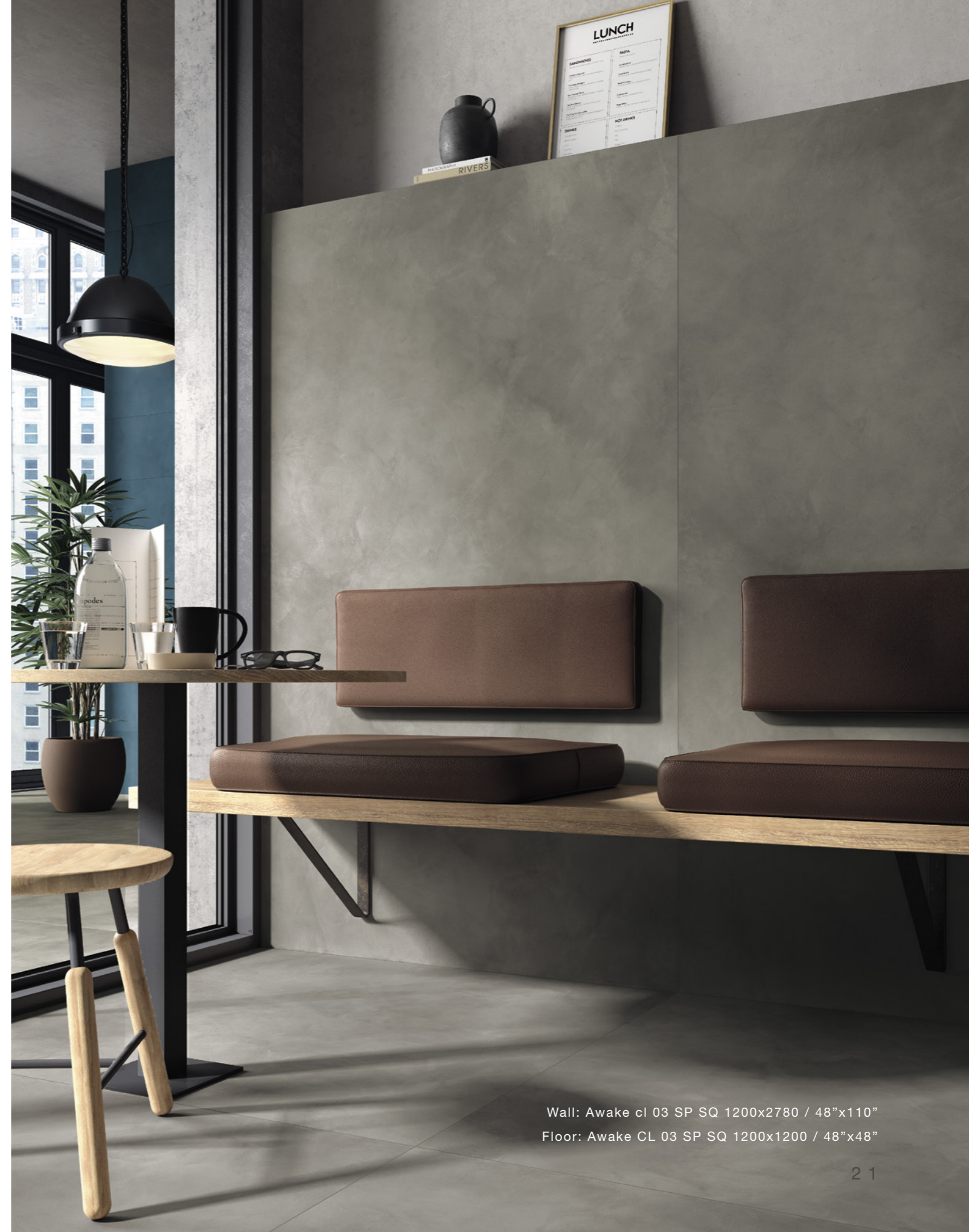
Wall: Awake cl 03 SP SQ 1200x2780 / 48"x110" Floor: Awake CL 03 SP SQ 1200x1200 / 48"x48"