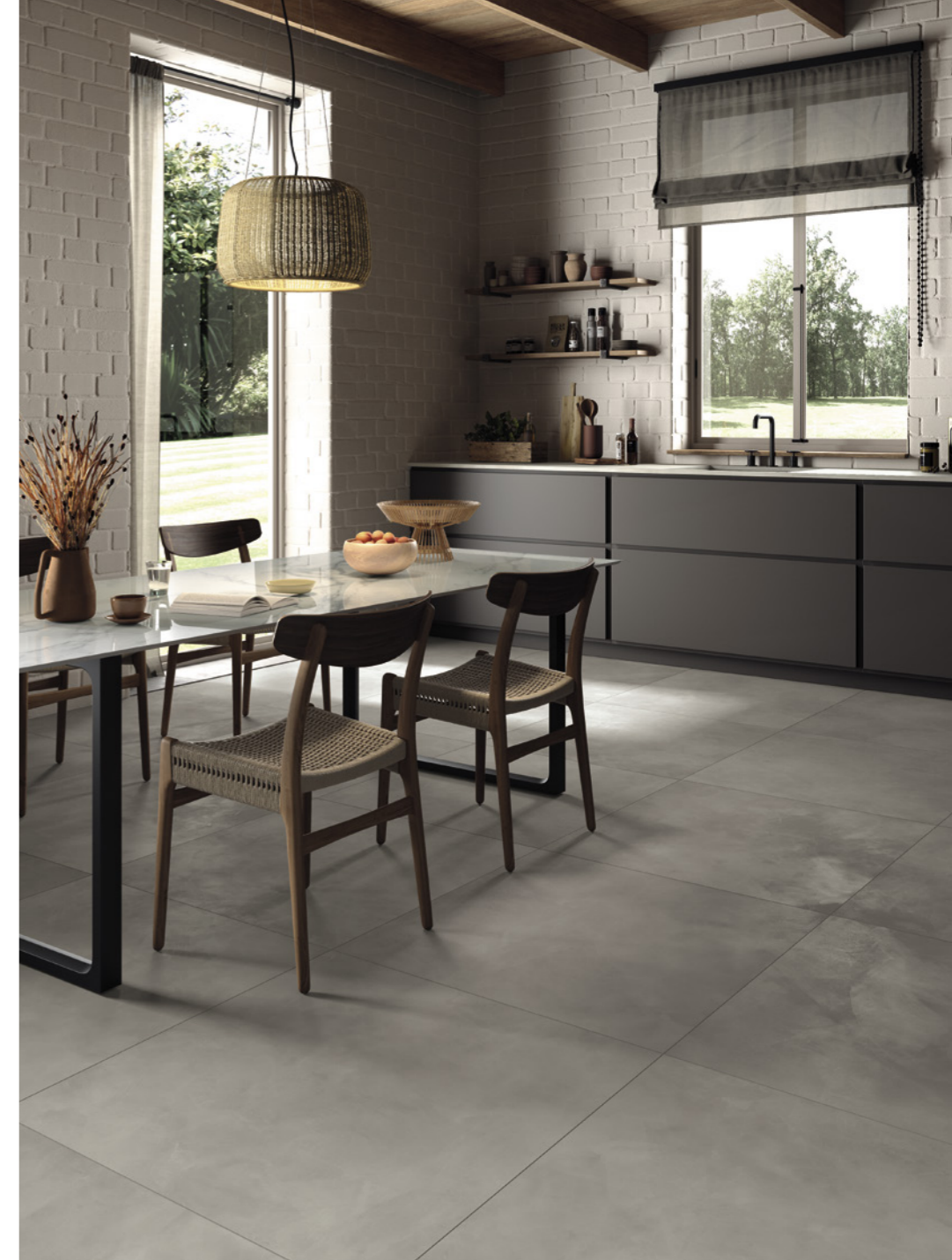
Table: Jewels Statuario Venato JW 14 LUC SQ Floor: Awake CL 03 SP SQ 800x800 / 31½"x31½"