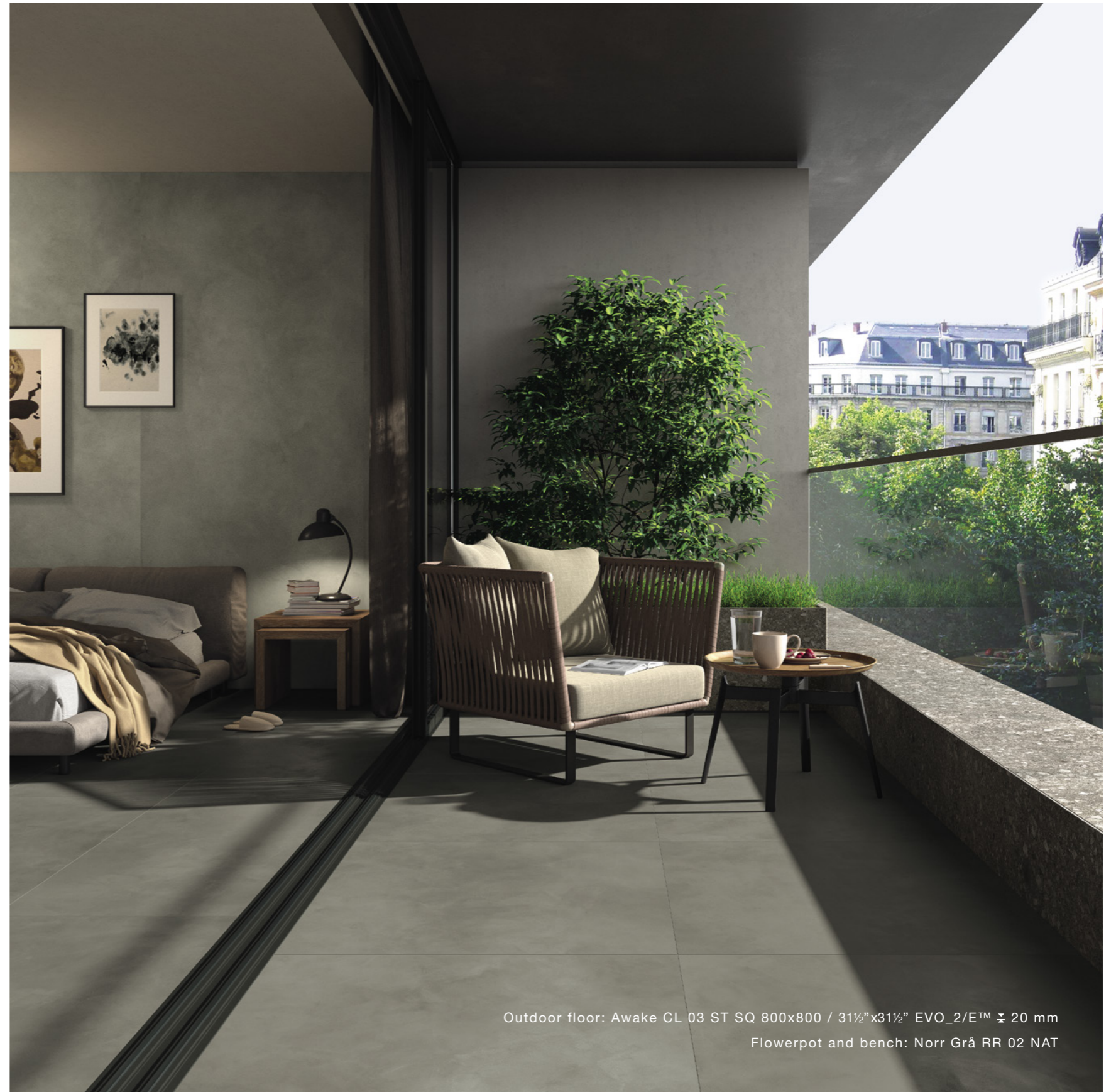
Outdoor floor: Awake CL 03 ST SQ 800x800 / 31½"x31½" EVO_2/E™ ± 20 mm Flowerpot and bench: Norr Grå RR 02 NAT