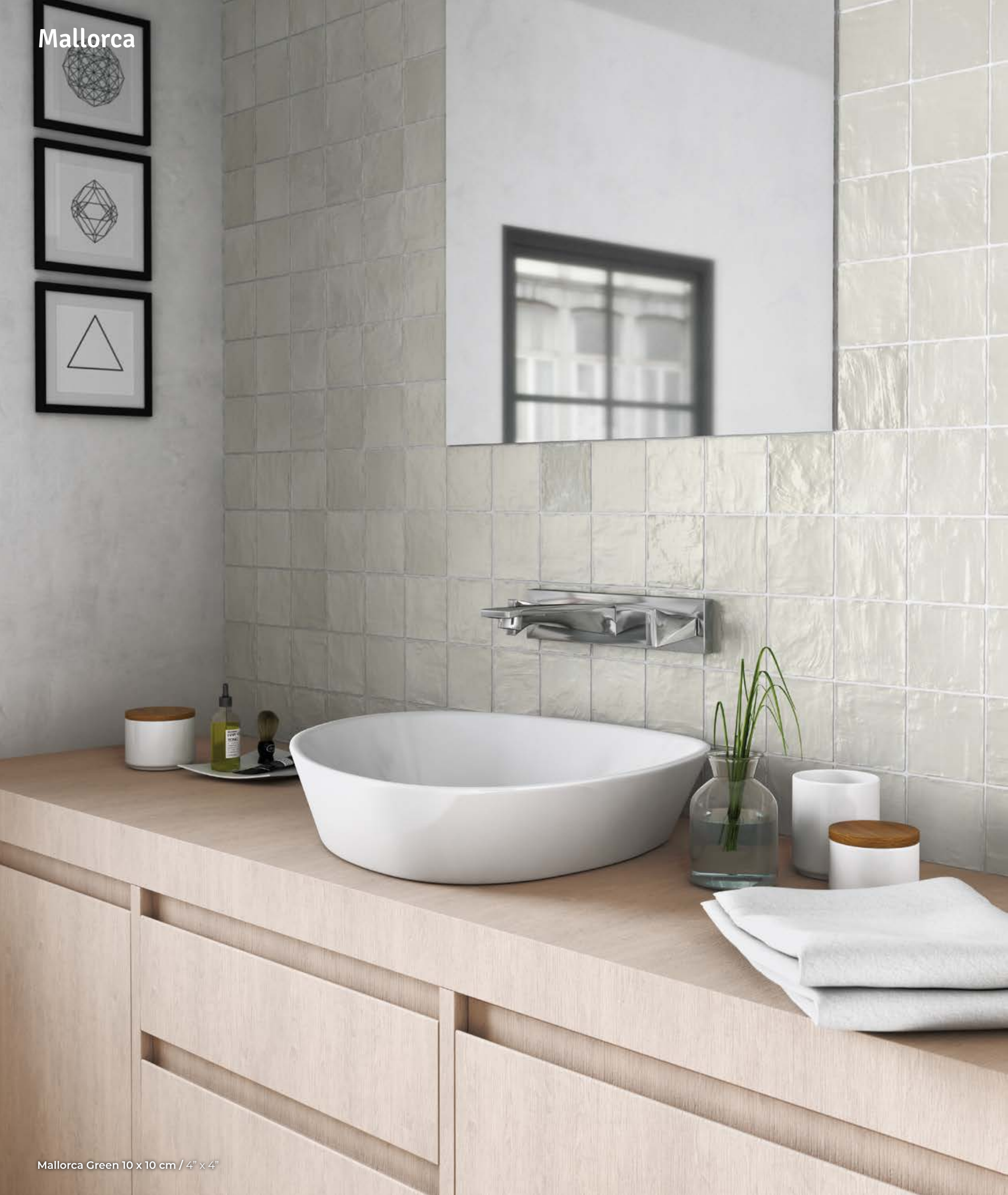
Mallorca Green 10 x 10 cm / 4" x 4"