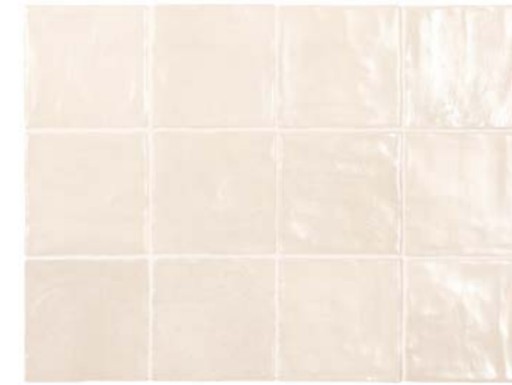
Cream 23258 EQ-3