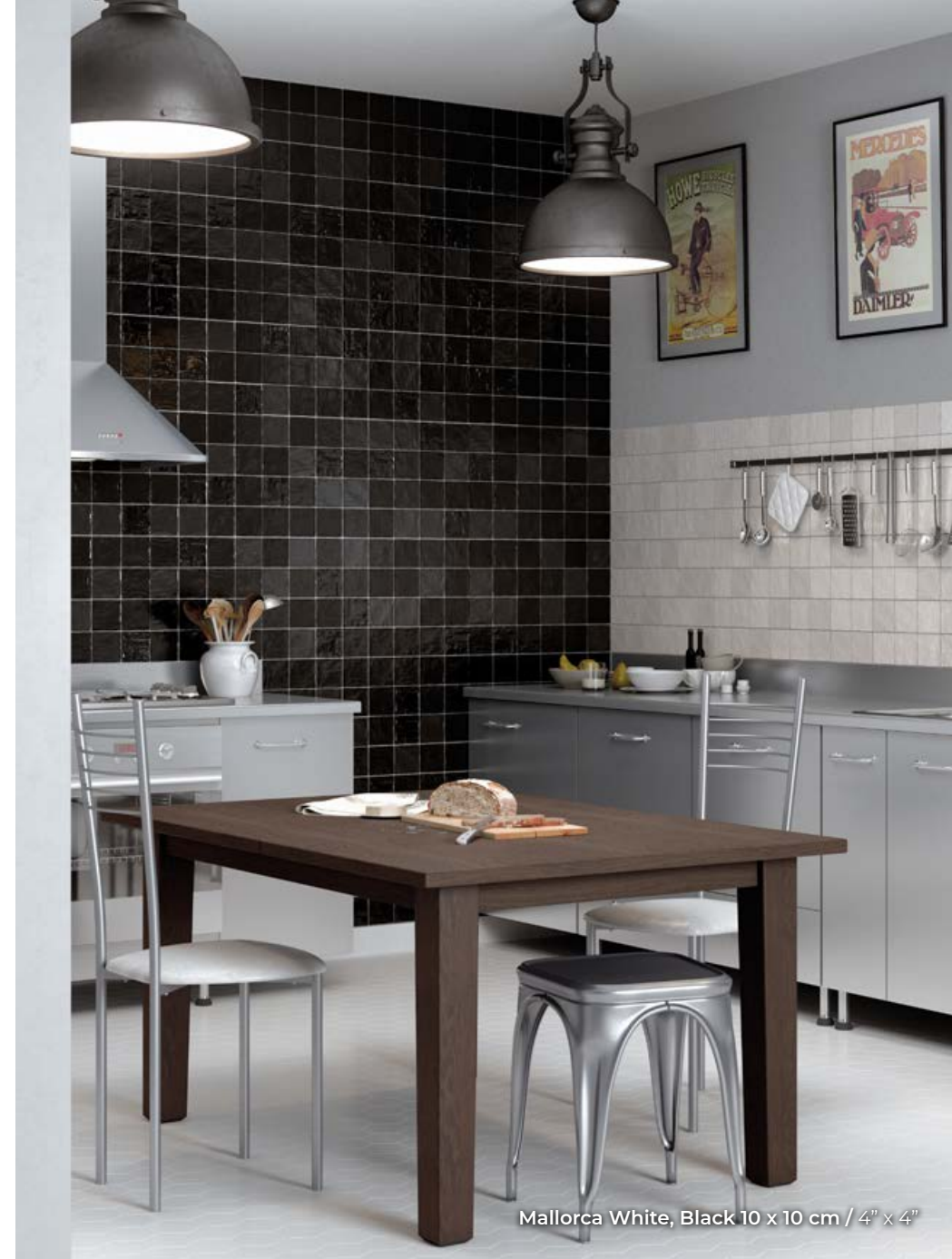
Mallorca White, Black 10 x 10 cm / 4" x 4"