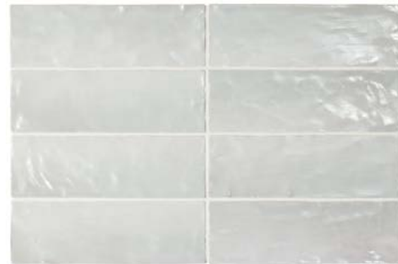
Blue 23254 EQ-3