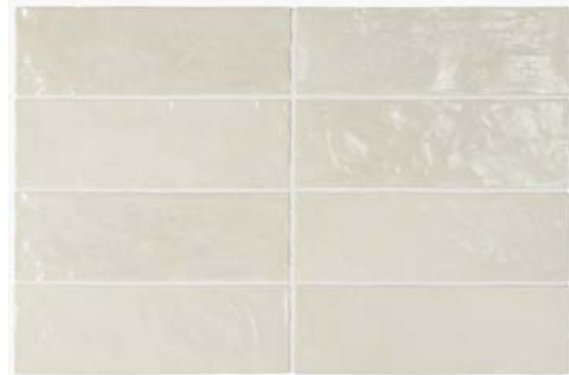
Green 23255 EQ-3