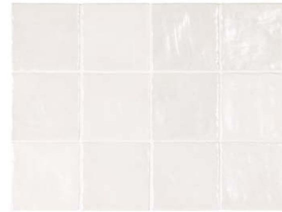
White 23257 EQ-3