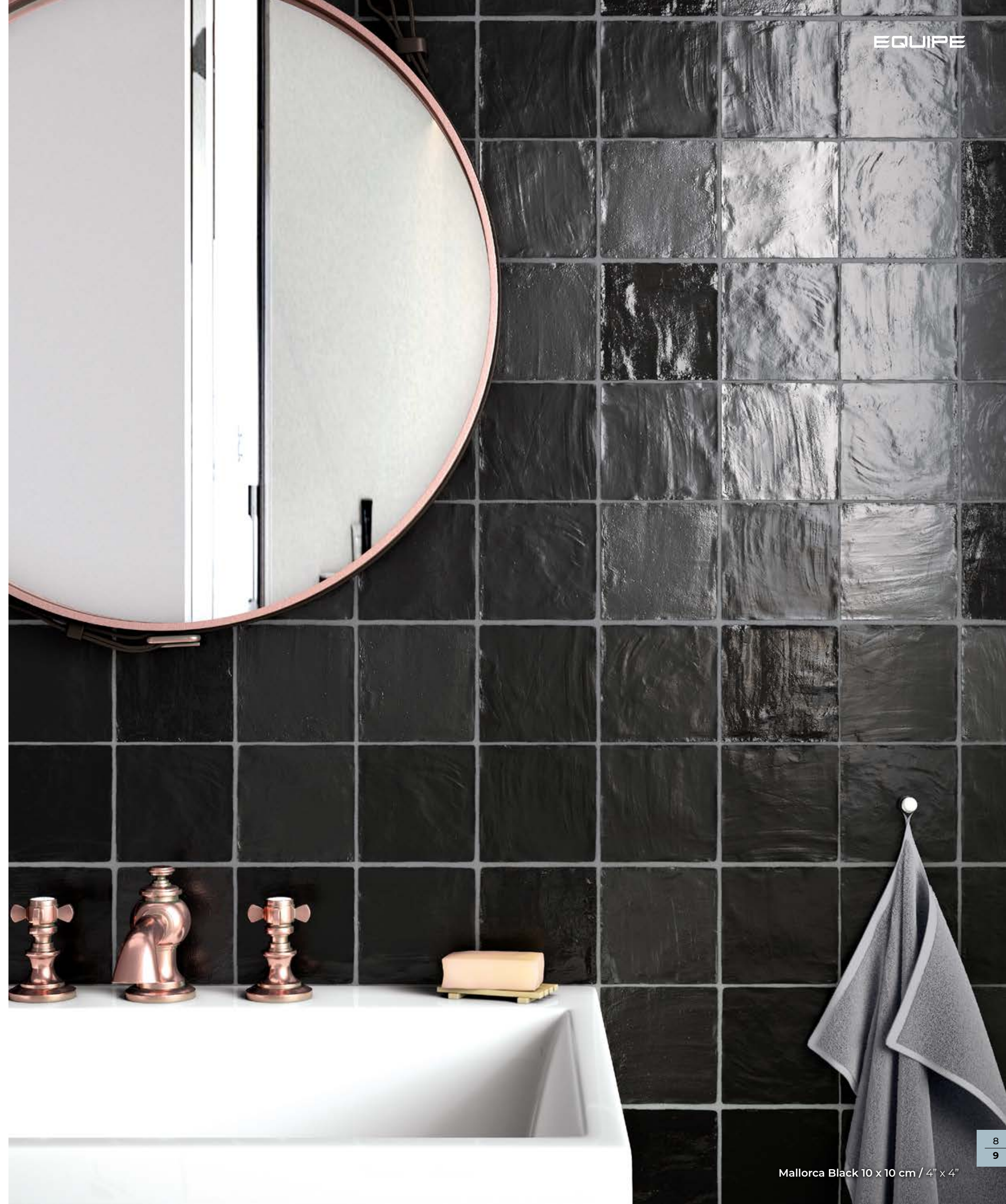
Mallorca Black 10 x 10 cm / 4" x 4"