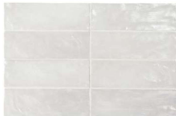
Grey 23253 EQ-3