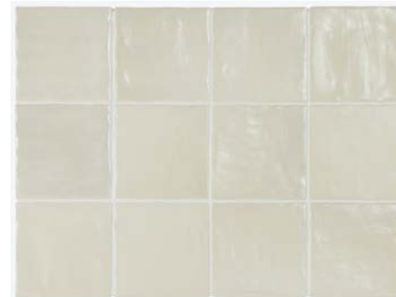
Green 23261 EQ-3