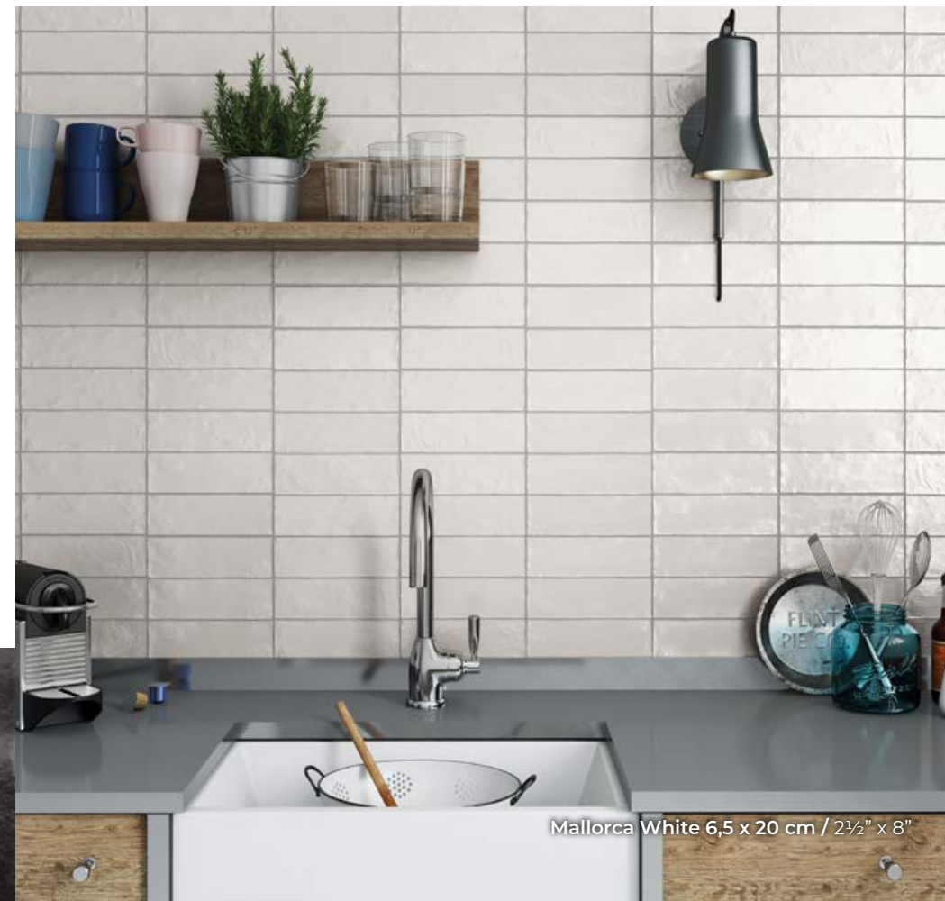
Mallorca White 6,5 x 20 cm / 2½" x 8"