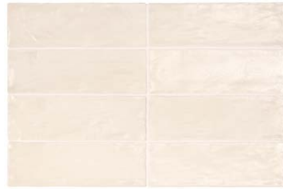
Cream 23252 EQ-3