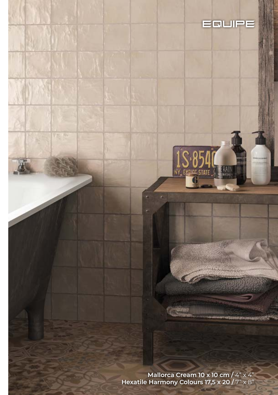
Mallorca Cream 10 x 10 cm / 4" x 4" Hexatile Harmony Colours 17,5 x 20 / 7" x 8"