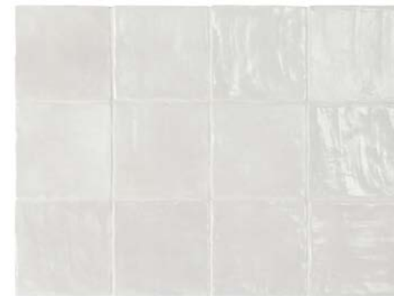
Grey 23259 EQ-3