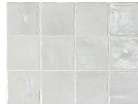
Blue 23260 EQ-3