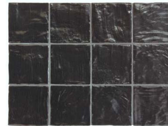
Black 23262 EQ-4