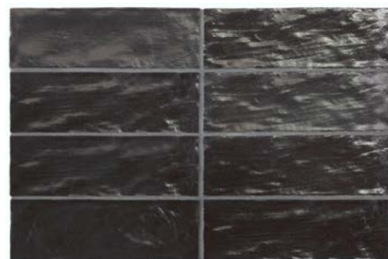
Black 23256 EQ-4